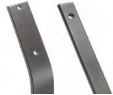
Different hole configurations